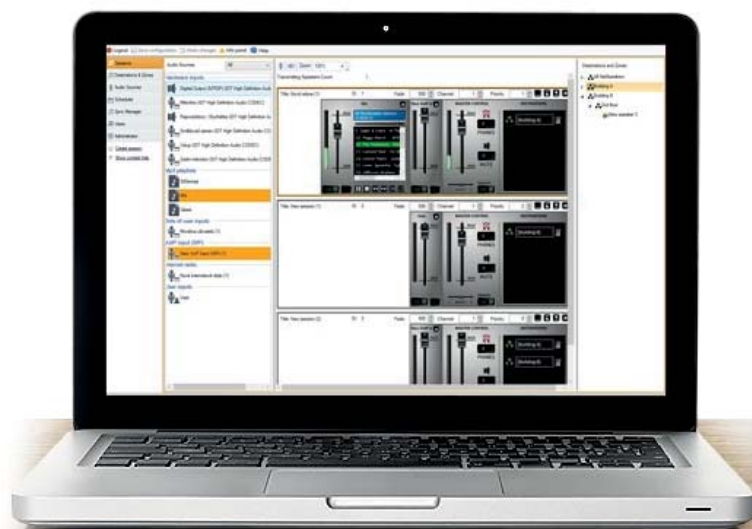
2N® NetSpeaker Control Panel