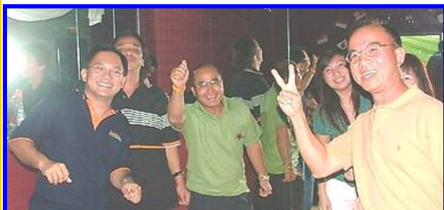
More members of the Thai Team have fun on the dance floor.