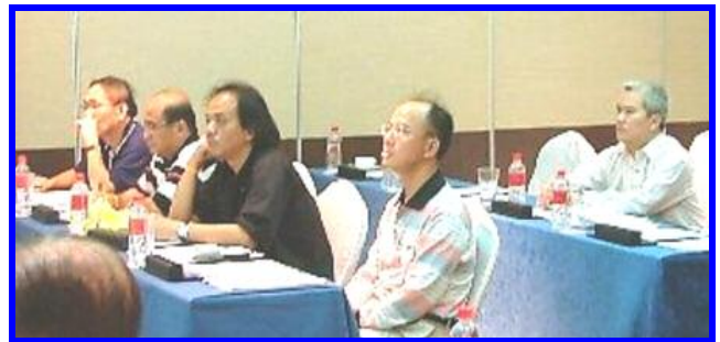
Conference attendees focus their concentration during an information session.