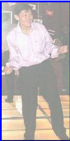
Chew does Elvis.

Zhone is enabling enhanced services by allowing network operators to offer broadband services over their existing networks today, while simultaneously retooling for packet-based VoIP and IPTV, over both copper and fiber access lines.