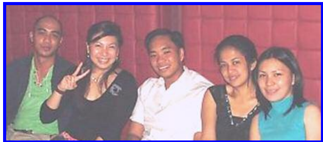
Velle 'keeps the peace' with some One Commerce fans.

Zhone is enabling enhanced services by allowing network operators to offer broadband services over their existing networks today, while simultaneously retooling for packet-based VoIP and IPTV, over both copper and fiber access lines.