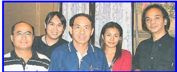
The TOT Public Company Team

"Through the information sessions we outlined how our people can market our products more effectively."