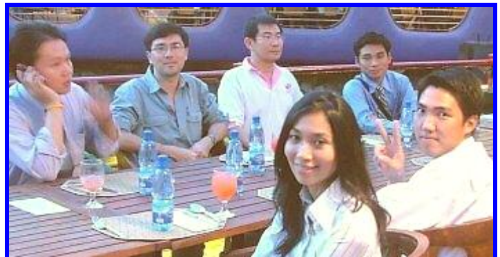
The Thailand contingent at the Lotus Grill dinner.