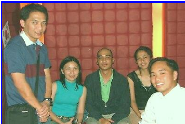
The One Commerce Team from the Philippines relaxes at the Ministry of Sound nightclub.